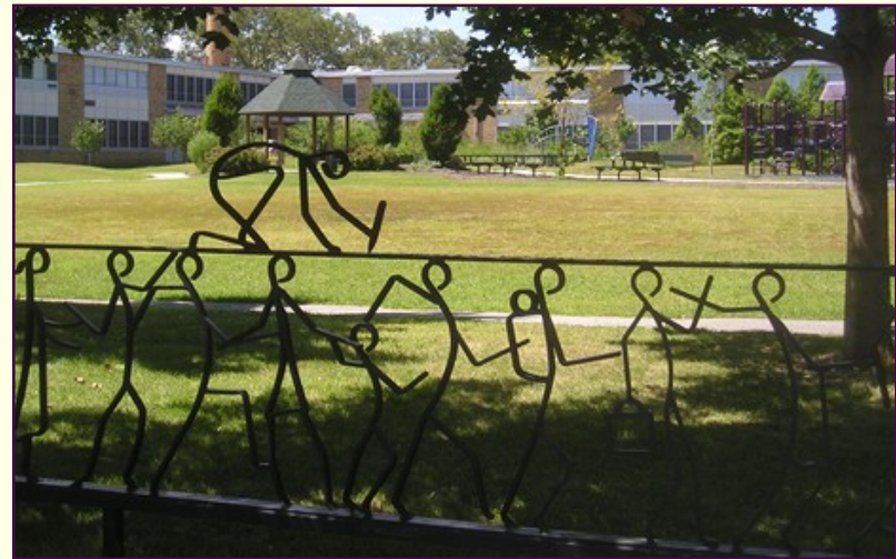
Orchard School Fencing, Cleveland, OH