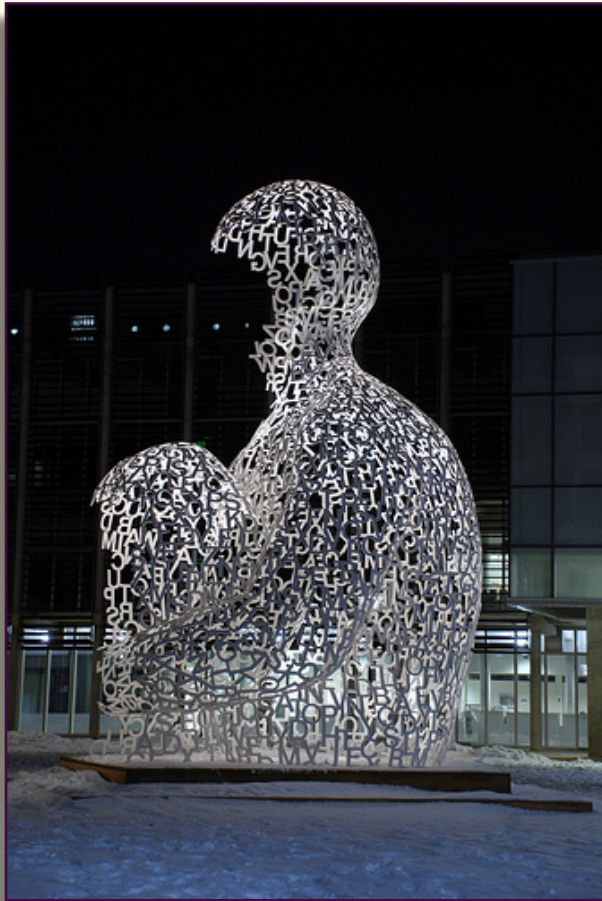
“Nomade” by Jaume Plensa Gateway Park, Des Moines, Iowa