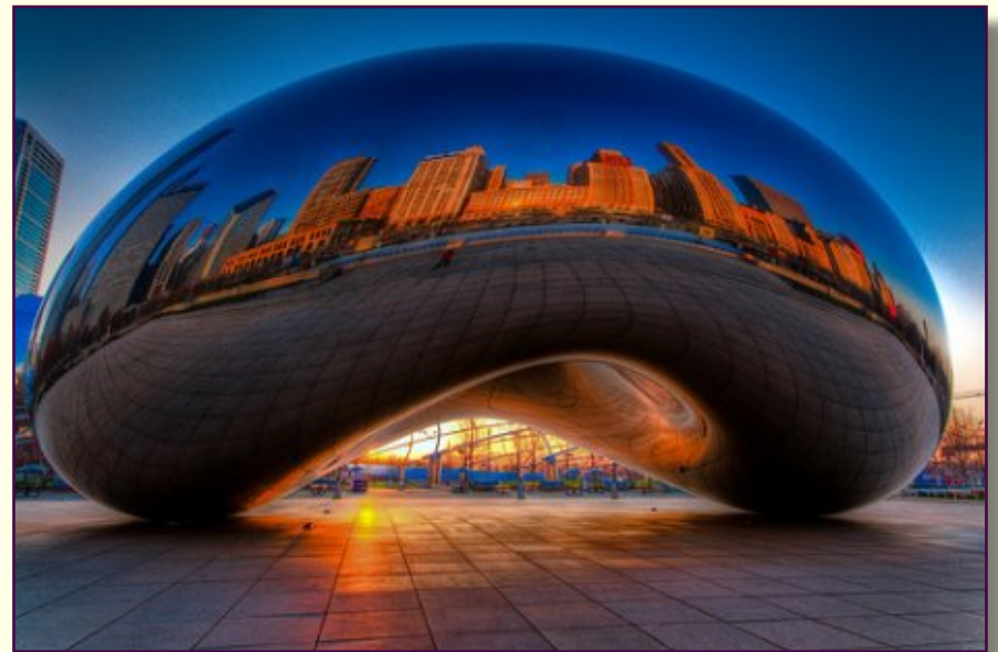
Cloud Gate by Anish Kapoor Chicago, IL