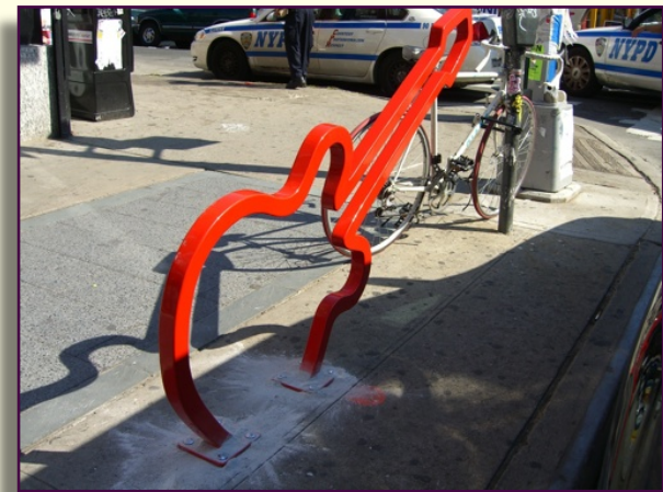
Artist David Byrne – NYC Bike Rack