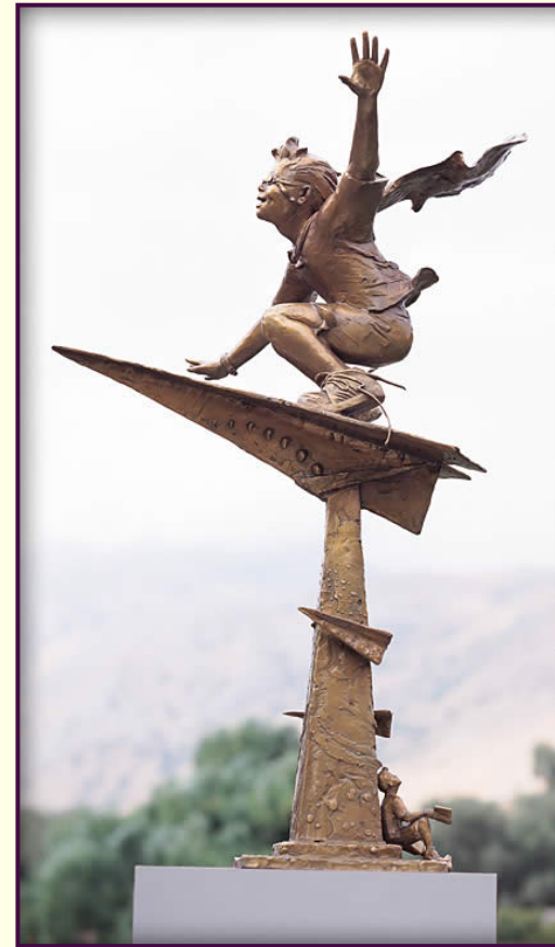
“Journeys of the Imagination” Gary Lee Price $25,000