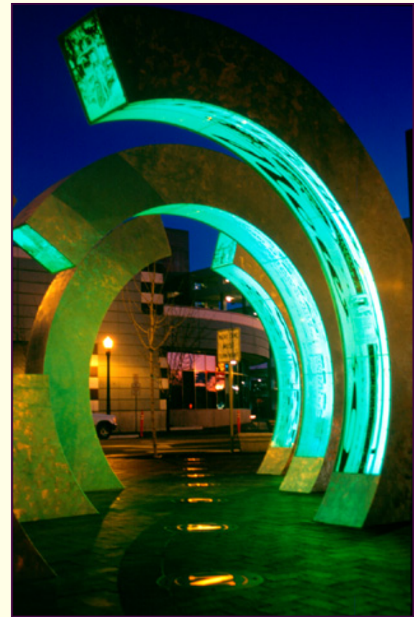
Grove St. Illuminated and Boise Canal